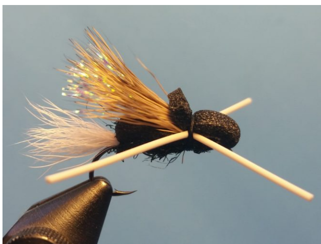
Finished “Improved Michigan Skunk”

Step 10. Tie in a rubber leg on each side of the fly and trim. The front legs should be slightly shorter than the rear legs. Whip finish and apply two coats of water-based head cement to the thread wraps.