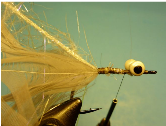
Step 5. Tie in a schlappen feather by the tip.