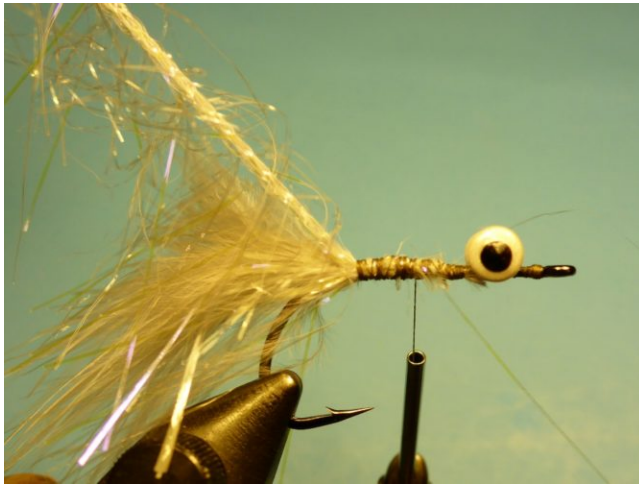
Step 4. Tie in a strand of Polar Chenille.