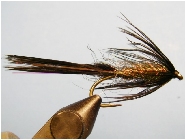
Ice Bugger – Effective on Steelhead, Salmon and Trout

Yet another variation of the effective wooly bugger, the Ice Bugger is simplified, is easier to tie and offers just a little bit more slink and suave motion than the original. The Ice Bugger isn't a radical departure from the Steelhead Bugger – which was the influence when I was looking for a way to tie a bunch of effective flies, quickly – and ended up with this design.