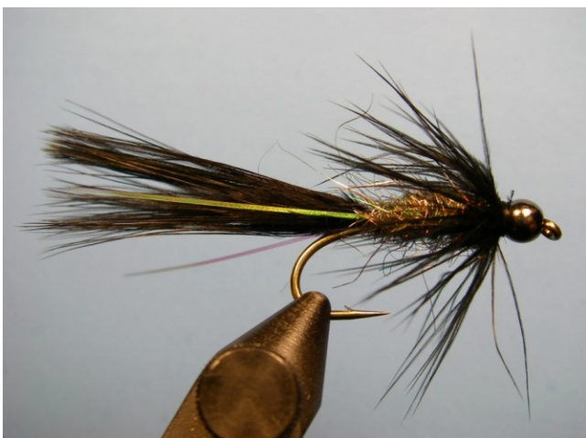
Option: Add a Bead Head to the Ice Bugger

While it isn't the most creative fly or variation of an existing pattern that I have come up with, the Ice Bugger does speak for itself when in the water and what eats it. Originally I tied it for Salmon and Steelhead, I have since found it works well for Trout – typically fished swung with little strips back – especially when you add a black bead head and fish it on a floating line. When using this pattern on Steelhead and Salmon, fish it just about any way you would fish a nymph – dead drift, bottom bounce and/or under a float/strike indicator. To learn more about rigging for Steelhead and Salmon fishing, click here .