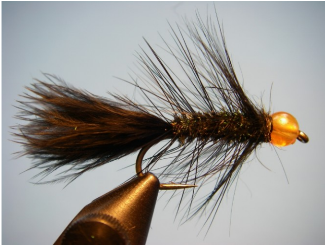
Egg Sucking Leech

Egg Sucking Leech patterns are well known by steelhead and salmon anglers and this pattern is just a little more realistic looking than many of the patterns found in fly shops today.