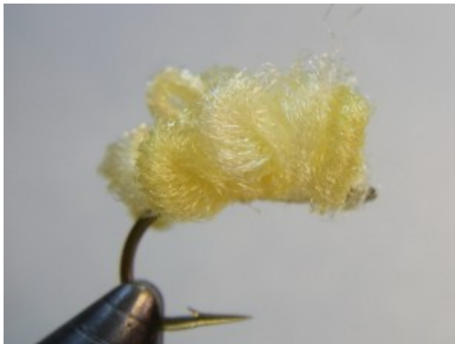
A complete Sucker Spawn Egg Pattern