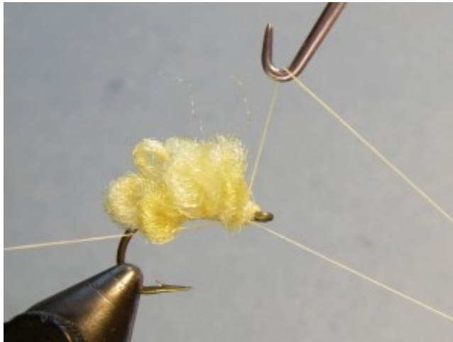
Step 6. Whip finish.