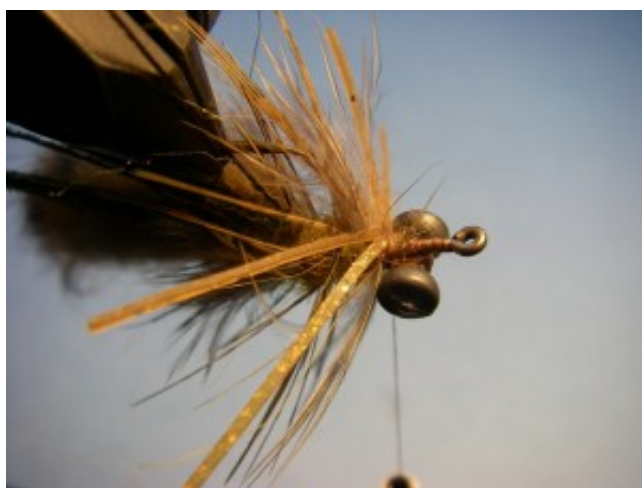
Step 7. Figure-8 some Sili-Legs.