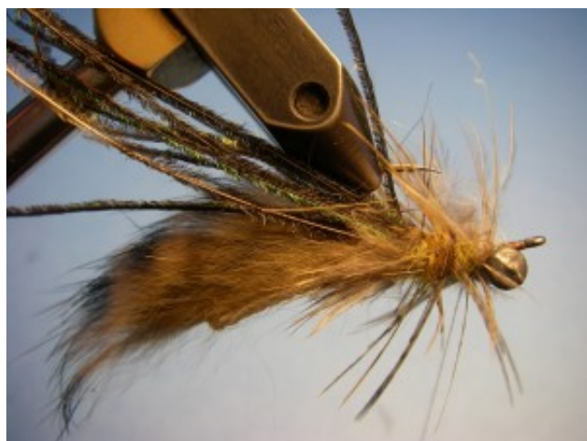
Step 6. Palmer hackle and tie off behind eyes.