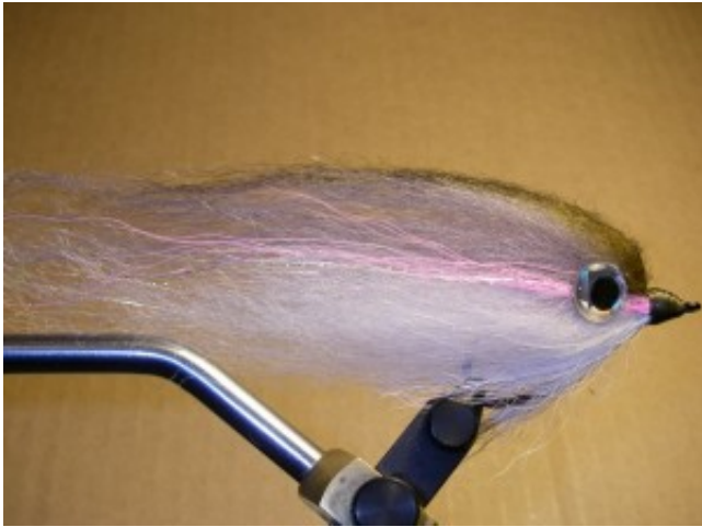
Fin Clip – Imitates Stocked Rainbow Trout and