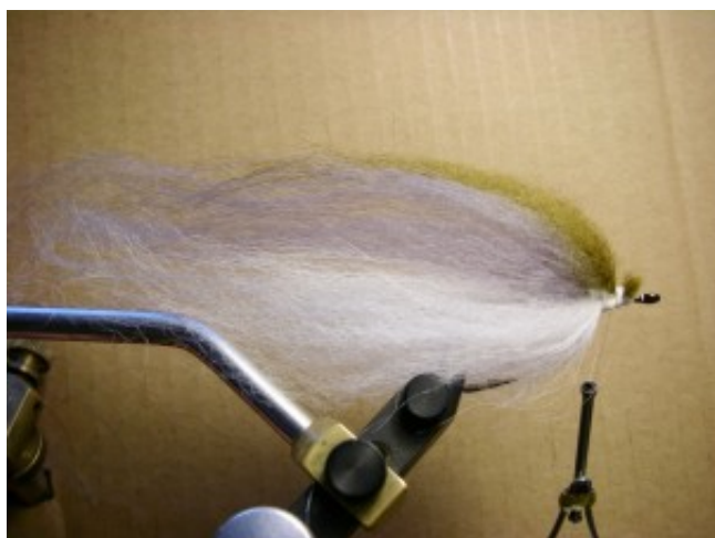
Step 6. Tie in the second Section of Sheep Hair on top of the hook – a mix of Silver Gray and Olive Brown.