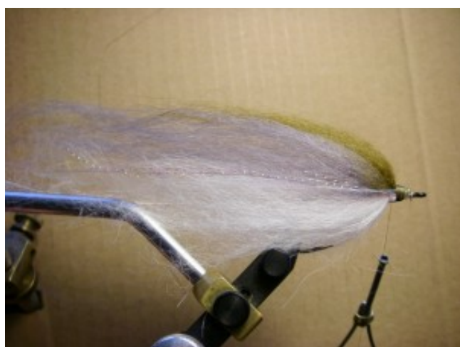
Step 7. Tie in a strand or two of Krystal Flash and some subtle flash material like Angel Hair