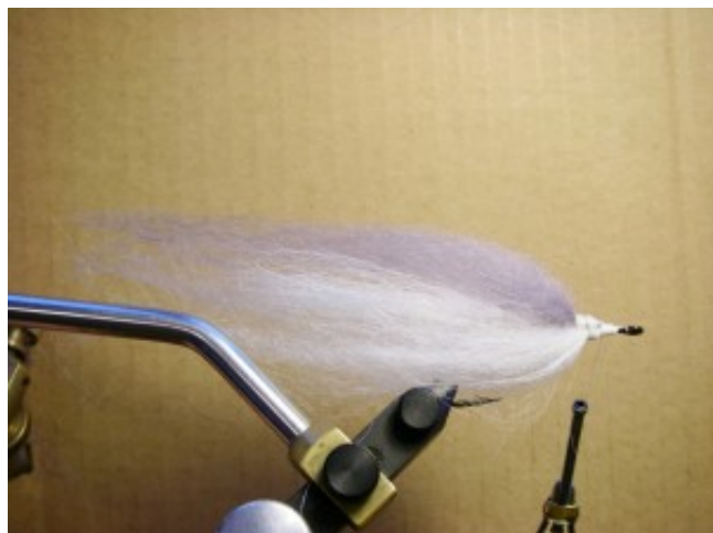
Step 5. Tie in the second section of Sheep Hair on the underside – white.