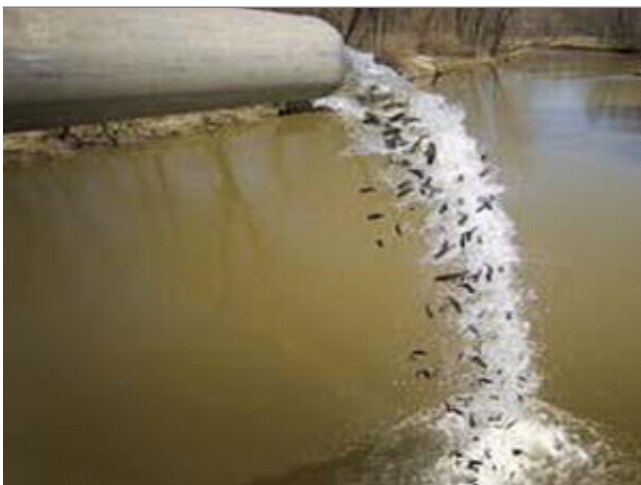
Stocking Hatchery Fish Becomes A Food Source

The Fin Clip was designed to imitate naïve hatchery rainbow trout put into the wild where the natives take note and eat big. I first started tying this as a small baitfish pattern but it soon became “super-sized” after seeing some large fish eat the stockers. After I tied some for a few fellow guides it didn’t take long to become a favorite of both anglers and fish looking for something big.