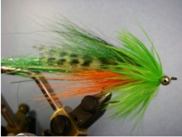
Fire Tiger Whistler