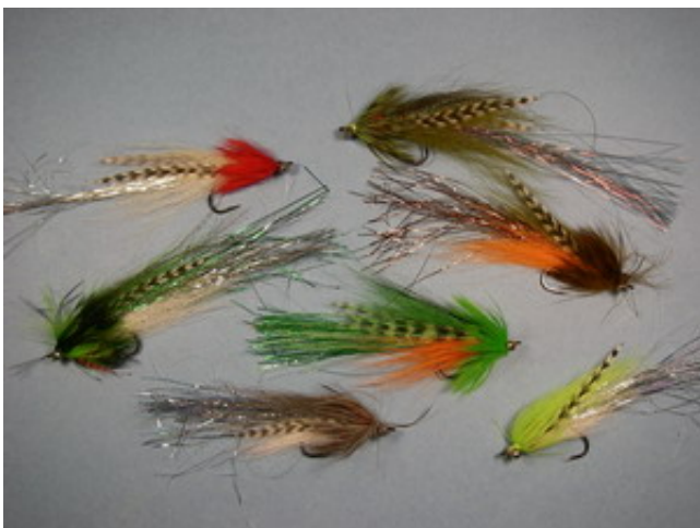
Assortment of Colors for an Assortment of Species

Beyond pike and musky, I have found various sizes and colors to work well for trout, bass and salmon. The color choices are endless and this particular scheme is a favorite of salmon when they first are in the river. Anglers using lures for these fresh salmon have an affinity for Storm Thunderstick lures in Fire Tiger and it's effectiveness has led me to tying this fly pattern in a similar color scheme. Make sure your fly box is filled with yellow/red, white/red, chart./olive, olive/yellow, orange/olive, and gray/white to be equipped and ready for various species in various situations.