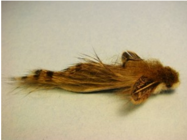
The Goblin – A Sculpin and Goby Streamer Pattern

The Goblin is a pattern that does a good job of imitating two important food sources to fish in the Great Lakes region: the Goby and Sculpin. This large profile fly provides a great silhouette as well as action and with its inverted hook, it's ideal when fishing either on the lake or river bottom and when fished around structure. The two-tone color perspective makes it very realistic and the barring of the rabbit helps create that illusion of food.